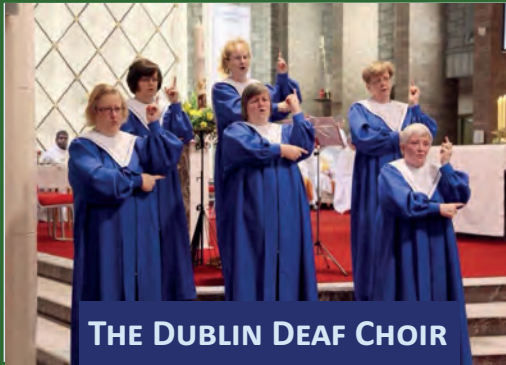
THE DUBLIN DEAF CHOIR

We welcome the Dublin Deaf Choir as they join us for our 11.30am Mass on Sunday, 10th Dec. 2017. It is always a great joy to have them with us and we look forward to them joining us.